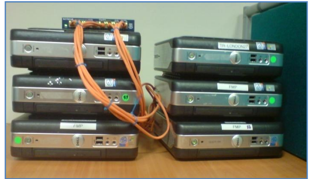
Figure 2. Part of the Linux Processing Cluster

I was also able to adapt the platform to operate successfully on Amazon Web Services™ EC2 Computing Cloud (although due to bandwidth constraints, this would not be feasible for image processing (5)) as well as configure the client to run as a low-priority background process on across our regular office workgroup of Windows-based workstations.