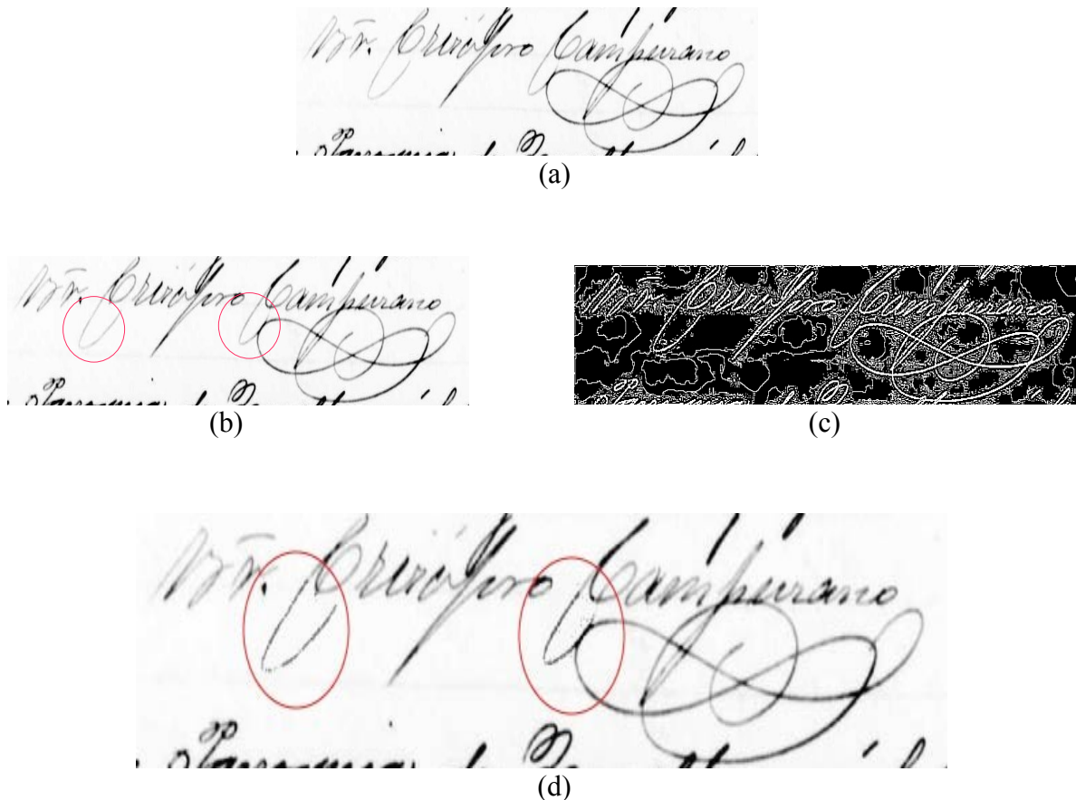
Figure 3: (a)(b) Original image (c) Laplacian Filter of the already smoothed image (d) Strokes recovered

Hence, with the help of the bilateral filter, the user and the mouse, we can better accentuate the soft strokes, thus helping us read the character better.